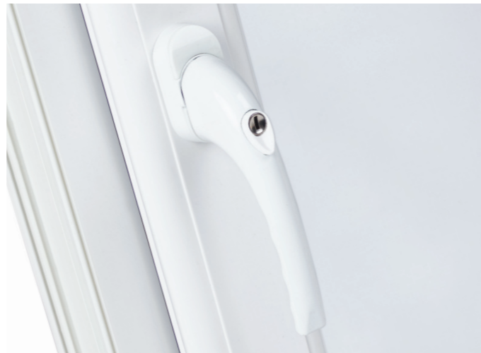
Suited window furniture available