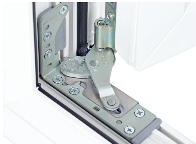
Easy to assemble corner hinges and adjustment point