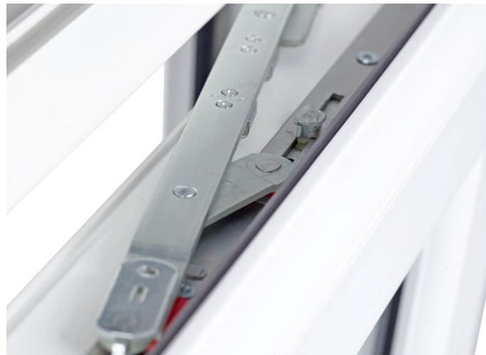
Anti-blowback device automatically engages when in tilt position