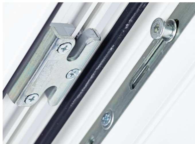
High security locking as standard